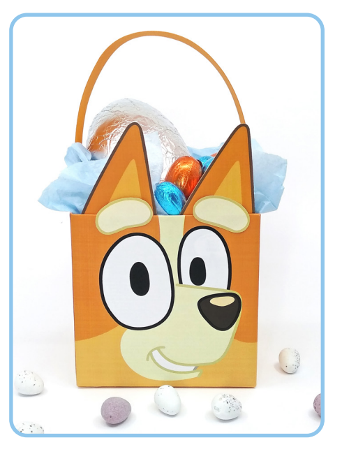
Yeah! Your Easter basket is ready - let the egg hunt begin!

5. To finish, cut a dark orange paper strip and glue it into the sides of the box to create the basket handle.